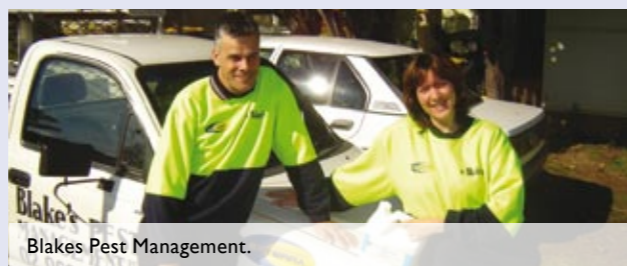
Blakes Pest Management.

Also we have no damage occurring to our seals or hoses. Consequently, Maxxthor is now our key upfront, all-round insecticide.”